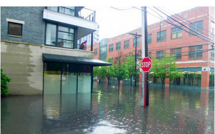
Before H-5 WWPS, May 31, 2015: Looking northwest at Madison and 9th Streets.

Between November 2016 and April 2017, the new pump station handled four storms large enough to previously cause flooding along 9th and Madison. In each case, the pump prevented flooding. It was not until the extreme storm of May 5, 2017 that street water was seen in this area, and the pump station rapidly drained the water from the roadways.