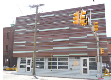
H-1 Wet Weather Pump Station

In 2011, at the cost of $18 million, the North Hudson Sewerage Authority built its first Wet Weather Pump Station (H-1) on Observer Highway at Washington Street to address the flooding in the southwest neighborhoods. Its two massive 50 million gallons per day (mgd) pumps can pump flow out of the City and into the river against high tide. The pump station has had an immediate beneficial impact.