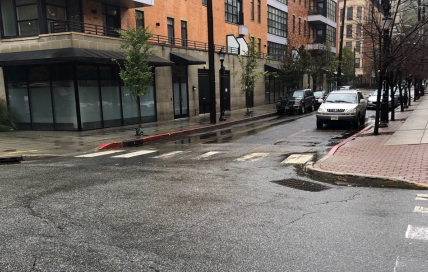
After H-5 WWPS, October 27, 2018: Looking southwest at Madison and 9th Streets.

Even with the pumps operational, extremely intense storms may cause some flooding. When residents see water ponding in the streets, some wonder if the pumps are working properly. They are. During intense storms, the rain falls so quickly that the catch basins and combined sewer lines fill up within minutes. The pumps kick in and begin pumping water out of the lines even against the tide, but some pooling of water on low-lying streets will occur. The pumps handle the rainwater as fast as it can be conveyed, the limitations being low street grades, water infiltration, and sewer capacity.